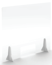
FREE-STANDING SCREENS WITH CUT OUT

COVFS6050 (w)600x(h)500mm COVFS7860 (w)780x(h)600mm COVFS1060 (w)1000x(h)600mm